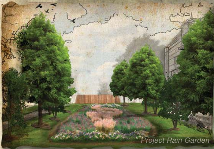
Project Rain Garden

Kempwood Manor, an In-town Homes, Inc. development project, is also the first development of any kind to be approved by Harris County under the new interim Low Impact Development criteria.