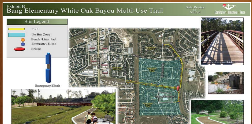
TxDOT Safe Routes To School Grant - Bang Elementary White Oak Bayou