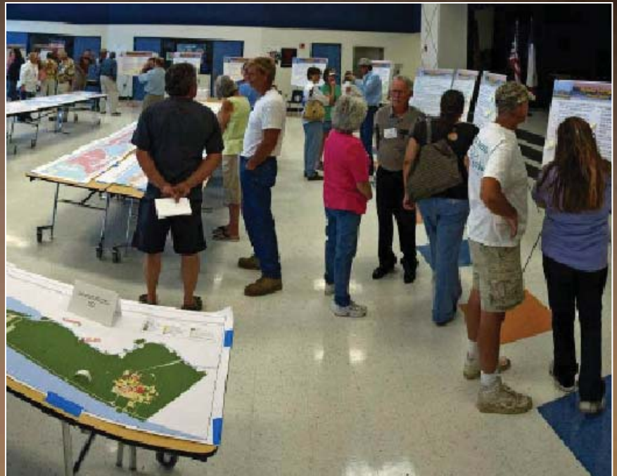
Bolivar Blueprint, ORCA Funding - Community Outreach Meeting

EHRA's staff strive to identify, pursue, and secure a variety of funding sources to supplement local resources. Knowledgeable in the complexity of various programs, EHRA can assist with Federal, State, and Local grant funded projects.