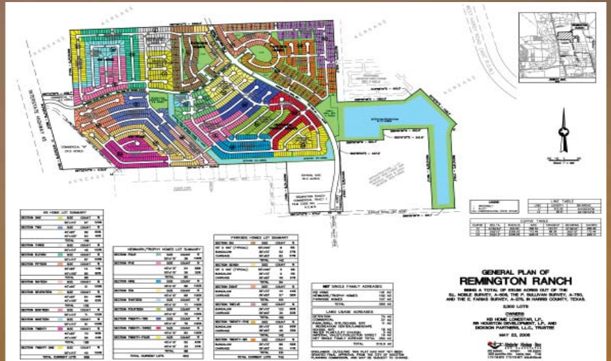
Remington Ranch - Harris County