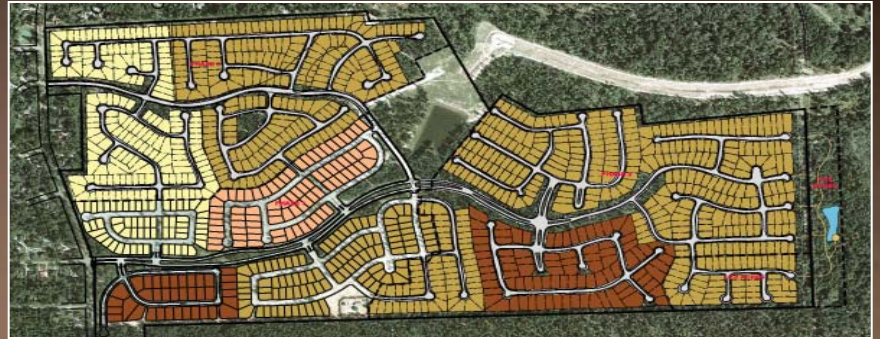
Jacob's Reserve - Montgomery County

EHRA has worked with private land developers and land development companies since the doors opened in 1936. Our years of paving, drainage and utility design is unsurpassed in Houston and the surrounding areas. This experience gives us the confidence and knowledge to handle any development challenge. From multi-acre, multi-use tracts to single-family start-ups and estate lots, our engineers and designers can get the job done with accuracy and efficiency.