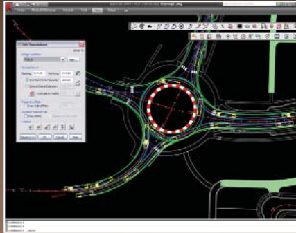
AutoCAD Traffic Simulation Module

EHRA is professionally staffed to handle Traffic Engineering and Transportation Planning including: preparation and review of transportation improvement plans, traffic operations; traffic signal designs, traffic control plans, transportation plans and mobility studies. Utilizing the latest in traffic engineering software and design, EHRA can expertly provide; traffic operations analysis; operational effects of geometric designs; traffic safety; traffic control devices and traffic engineering studies.