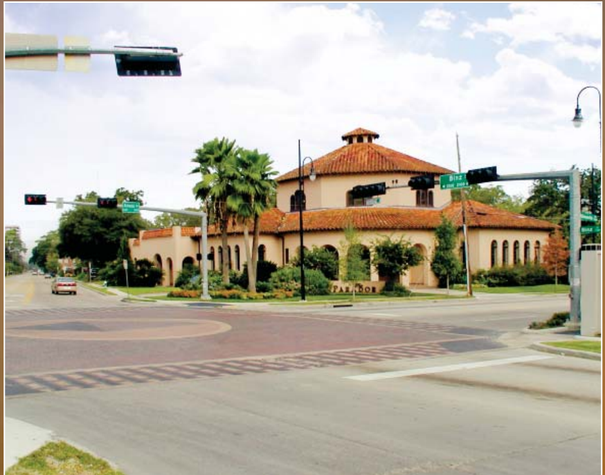
Alameda Road and Binz Intersection