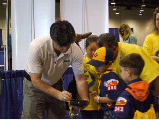
Demonstrating functions on the data collector

TrigStar Students sitting for the regional exam.