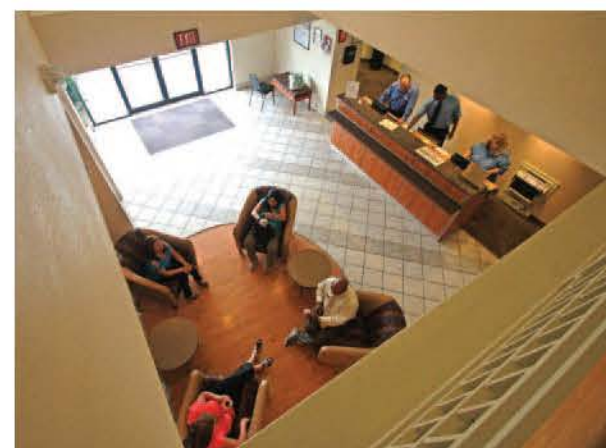
▲ The new owner spared no expense in upgrading this Westchase District hotel.

The hotel is located at 2960 W. Sam Houston Parkway S. For more information, visit www.redroof.com . WT