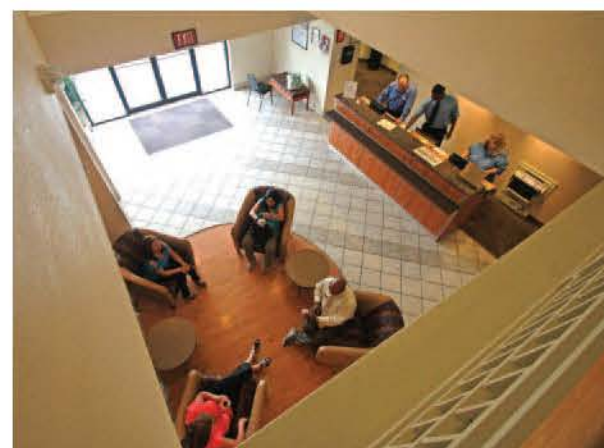
▲ The new owner spared no expense in upgrading this Westchase District hotel.

The hotel is located at 2960 W. Sam Houston Parkway S. For more information, visit www.redroof.com . WT